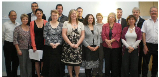
The FiCTION Trial Team - Newcastle, May 2009